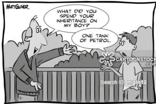
Why the modern day 'Prodigal Son' never gets far...